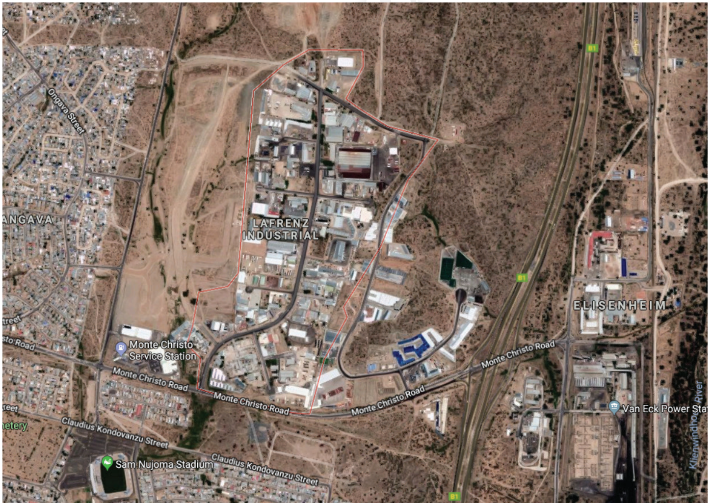
Map of Lafrenz Industrial Area

The City's Electricity Department completed the construction of the Lafrenz Load Centre in June this year. The load centre was upgraded from 6MVA up to 40MVA electricity capacity. The scope works of this contract includes but is not limited to the following; the dismantling of the existing Lafrenz Load Centre (6MV, 66/11kV) and the construction of a new 40MVA, 66/11kV Load Centre - which includes the supply and installation of a 66kV bus-section bay, two new 66kV incoming bays, two new 20MVA transformer bays, the construction of a new load centre building and supply of new 66kV control panel and the 11kV board.